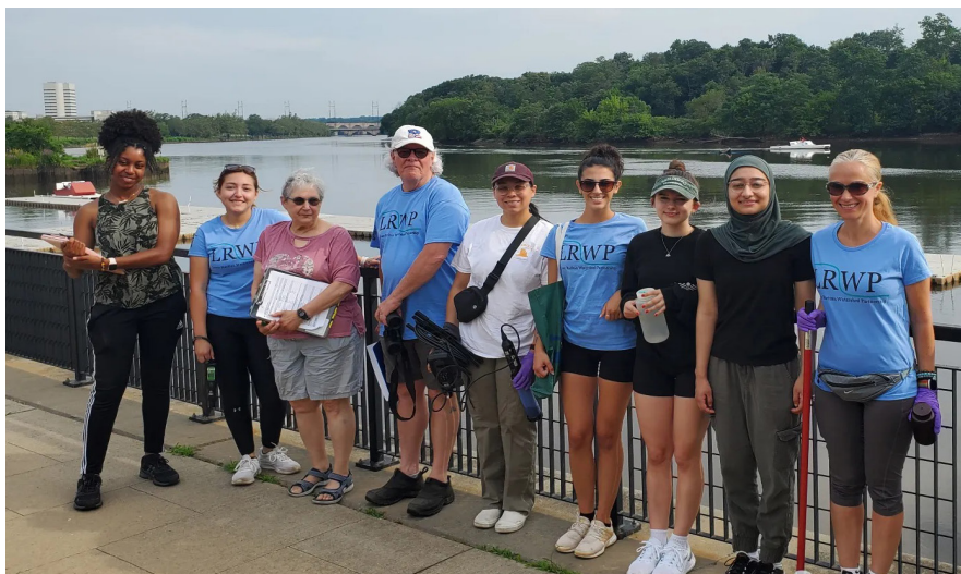
Members of the Summer 2024 Raritan River pathogens monitoring team are joined by the Interstate Environmental Commission for water quality testing at New Brunswick's Boyd Park.

The project also provided research opportunities for three undergraduate Rutgers students who helped with