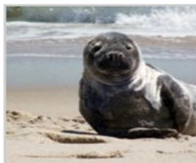
“Seal Bathing” / Paul Bagdanov