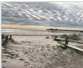
“Silvery Sands & Sky” / Paula Moore