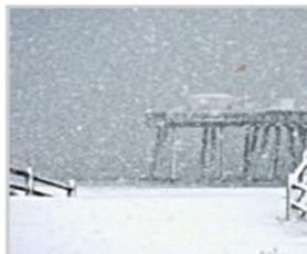
“White Out” / Mac Birch