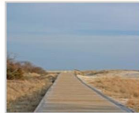
“Path to Perfection” / Kate Booth