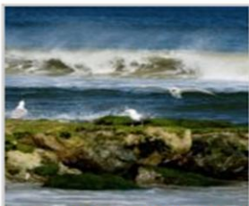
“Gulls on Jetty” / Virginia Rice