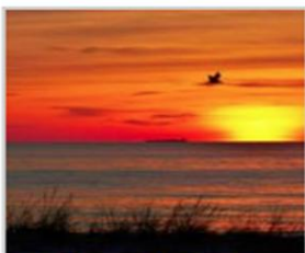
“Up & Away” / Ray Bogan