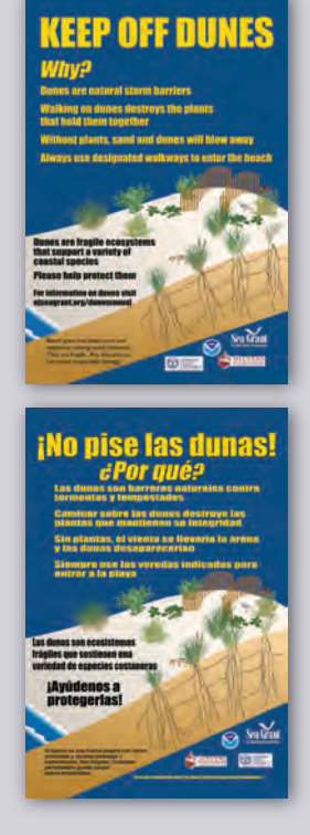
Number of "Keep Off Dunes" Decals ($25 each) English _____ Spanish _____

Number of Rip Current Awareness Decals ($25 each) English _____ Spanish _____