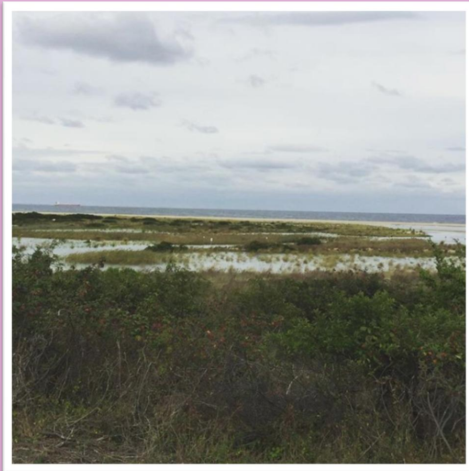
Instagram // Flooding at Gunnison Beach in Sandy Hook (Sept. 20)