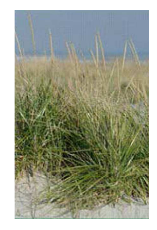
Figure 18. 'Cape' American beachgrass (Ammophila breviligulata)

American beachgrass ( Ammophila breviligulata ) (Figure 18) is a native, cool-season grass also known as dune grass that grows most prolifically in the zone of accretion in the foredune area. Once the sand becomes stabilized, American beachgrass loses vigor and yields to other species that provide long-term cover and stabilization. However, it should still be a component of backdune plantings as a quick cover or nurse crop.