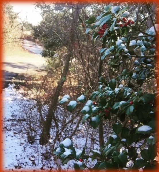
Budding holly found alongside a walking path near #Gunnison