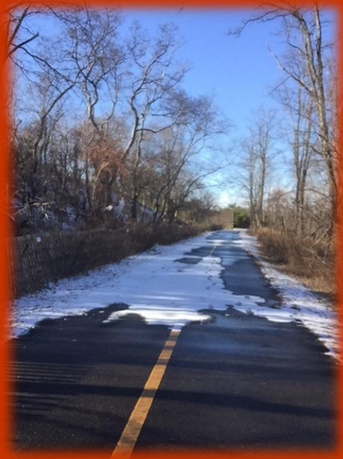
“The calm after the storm”