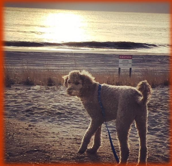
NJSGC's new pup mascot, #TaylorHam