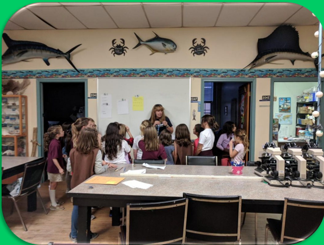
Brownie Letterbox, Scouts Program (11/2/2017)