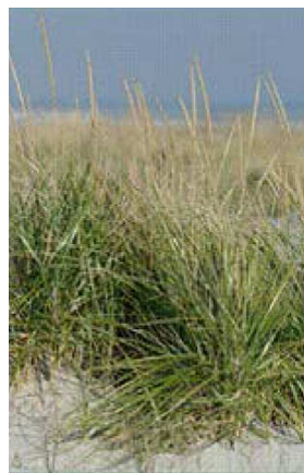
Figure 18. 'Cape' American beachgrass ( Ammophila breviligulata )

American beachgrass ( Ammophila breviligulata ) (Figure 18) is a native, cool-season grass also known as dune grass that grows most prolifically in the zone of accretion in the foredune area. Once the sand becomes stabilized, American beachgrass loses vigor and yields to other species that provide long-term cover and stabilization. However, it should still be a component of backdune plantings as a quick cover or nurse crop.