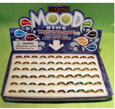
Mood Ring: Changes color according to your mood. $3.00 each, Item #13