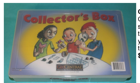
Collector's Box: Contains 18 sections. Great for treasures found on your NJSGC field trip!