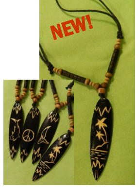
Surfer Necklace: Show off your love of surfing or the beach! $5.50 each. Item #5