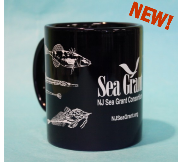
with NJSGC logo and local NJ fish species. $8.50, Item #16