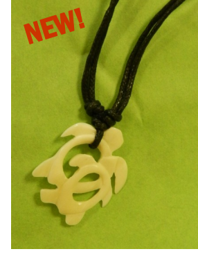
Two Turtle Necklace: Females are bigger than males in the wild. $8.25, Item #8