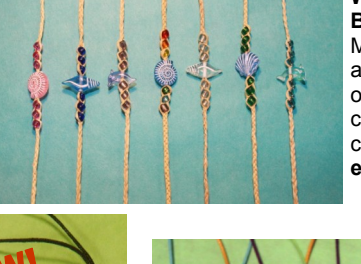
Wishlet Bracelet: Make a wish as you tie it on! Assorted colors, our choice. $3.00 each. Item #2