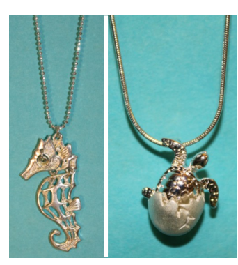
Necklaces: Show your love for ocean creatures with the Hinged Seahorse Necklace (Item #10), or Hatching Sea Turtle Necklace (Item #11), $9.00 each.