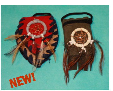
Dream Pouch: Great for holding change or your dreams. Can be worn as a necklace (our choice of color). $3.50 each, Item #7