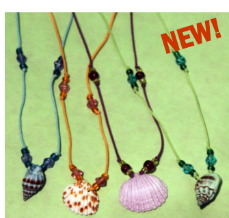
Shell Necklace: Great for that summer look! Our choice of color. $4.50 each. Item #6