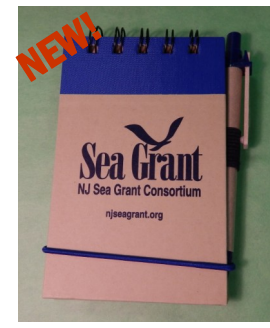
Eco-Friendly Notebook: This NJSGC logo notebook is perfect for all students. Jot down notes and reminders. 3" x 5" $6.25 each, Item #21