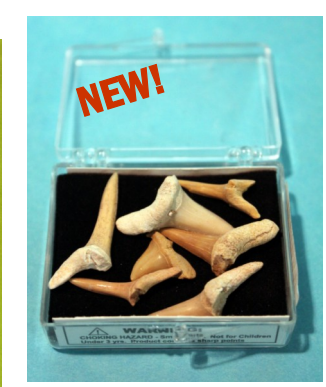
Shark Tooth Collection: 5-7 million year old shark teeth in a clearreclosable box. $3.00, Item #9

Dear Students and Parents: Thank you for your purchase. All proceeds support K-12 education at the NJ Sea Grant Consortium. After completing your order, return it to your teacher along with payment in a sealed envelope or zip lock bag. Your order will be ready to take home and enjoy on the day of your trip. See you soon!