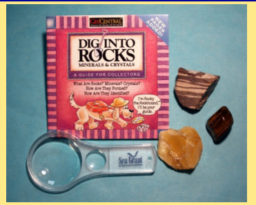
Geology Bag: Contains three genuine minerals, Dig into Rocks book and magnifying hand lens. $7.50, Item #33