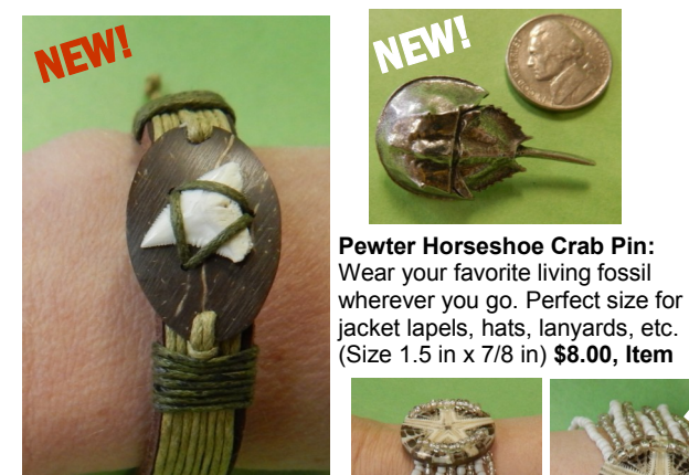
Shark Wristband: Great beach look for boys and girls of all ages. $5.00, Item #14