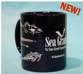
NJSGC Logo Mug: Navy blue mug